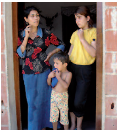
Building the Future. The priority is making Kosovo's European perspective a reality

The mandate of the ESDP mission will be terminated when the Kosovo authorities have implemented the terms of the Status Settlement and developed and gained enough experience to guarantee that all members of society benefit from the Rule of Law. ■