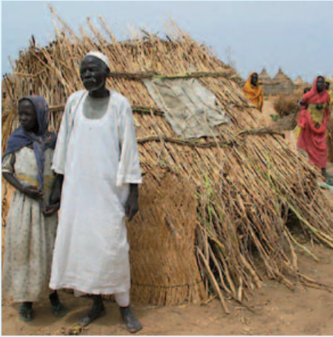
Civilian-military operation: Support to African Union In Darfur (Sudan).