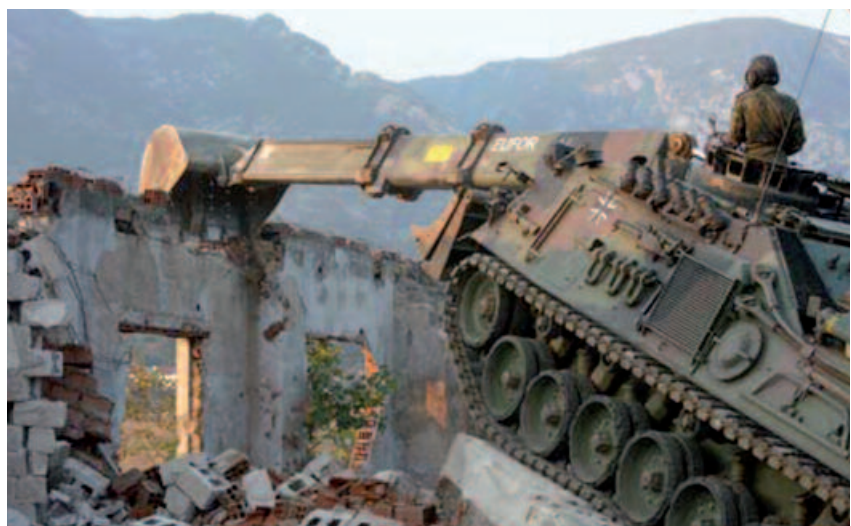
With an engagement that has reached 7,000 troops, Operation Althea in Bosnia is the most important EU military mission to date.

to the mission and leaders appointed for their abilities and personal commitment, is what will bring success in the best possible conditions.