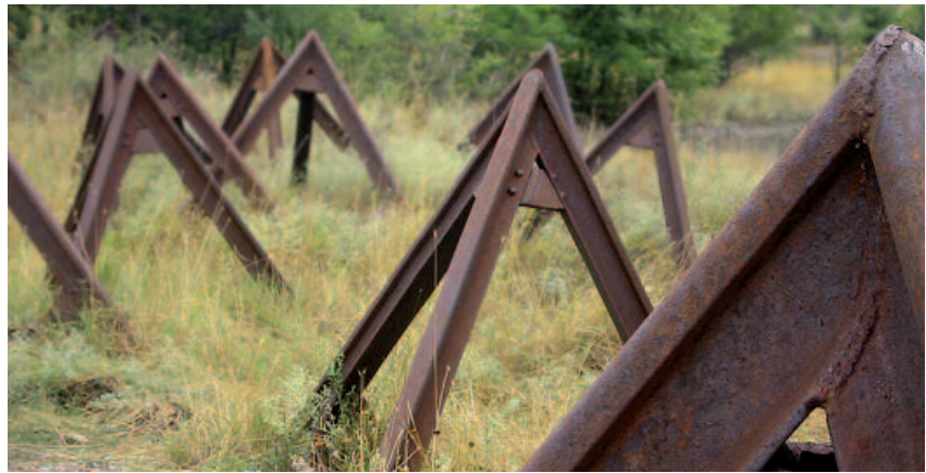
EU operations contribute to restoring security in crisis-torn countries.

My second comment bears more particularly on the Union's military capabilities, a term which I use to cover all the resources feeding into the action, i.e. planning, equipment and personnel. The planning of operations which the Union conducted alone (Artemis, and more recently EUFOR RD Congo) involved