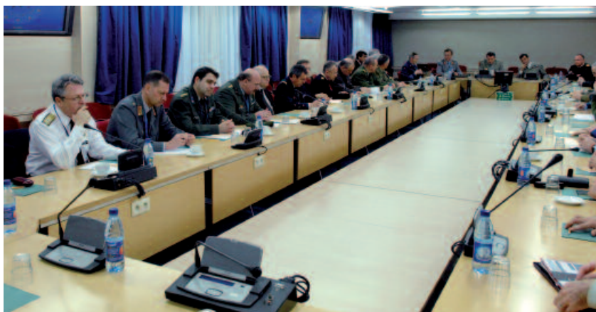
A visit by the EU Military Committee to the Operations Centre (21 February 2007).

So far, the EU has had two options as to how to run a military operation at the Operation Headquarters (OHQ) level. One option is, in a so-called "autonomous" operation, to make use of facilities provided by any of the five OHQs currently available in European Member States: France (used in "Artemis"), Germany (used in EUFOR RD Congo), Greece, Italy, and the UK. A second option is, through recourse to NATO capabilities and common assets (under the so-called "Berlin plus" arrangements), to make use of an OHQ located at Supreme Headquarters, Allied Powers Europe