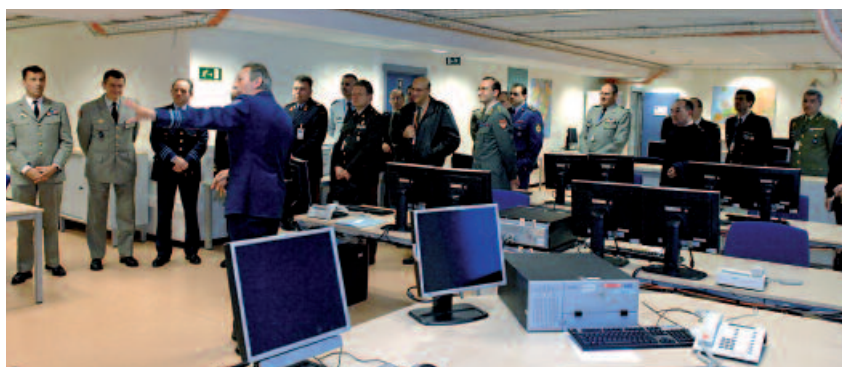
The EU OpsCen provides a new option for commanding missions and operations from Brussels.

Looking ahead, the military exercise MILEX 07/CPX will be conducted in June 2007. Its objective is to exercise and evaluate military aspects of the EU crisis management at the military strategic and operational level, including the activation of the Operations Centre. The exercise will focus on the interaction between the EU Operations Centre and an EU FHQ provided by Sweden in an EU-led crisis management operation. This exercise will be an important opportunity to exercise and evaluate the Operations Centre capacity, infrastructure, manning, functions, and procedures. ■