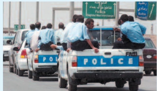
Rule of Law Mission: EUJUST LEX in Iraq.