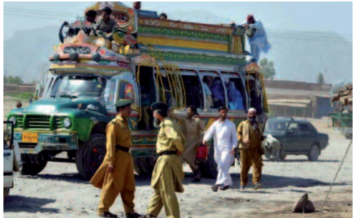
EUPOL will significantly contribute to the establishment of sustainable and effective civilian policing arrangements .