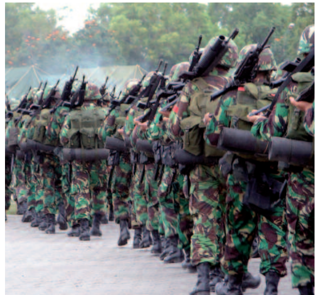
So far, the EU has carried sixteen missions including four military operations . (Aceh, September 2005)

“Political/military decision making needs to be fine-tuned”