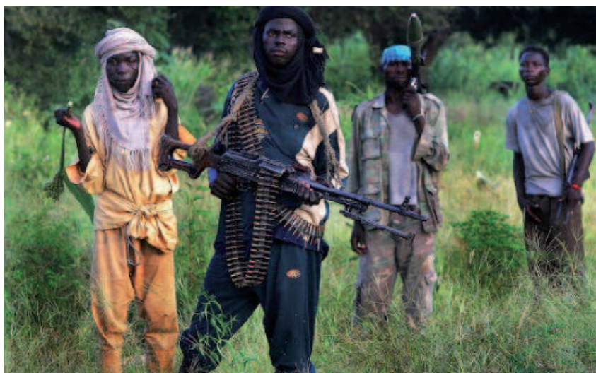
The conflict in Darfur has been raging since 2003.

While the AU is responsible for the safety and well-being of EU personnel, the EU has also made considerable efforts to improve their safety and living conditions. The EU has provided satellite telephones to each military officer. The EU has provided computer equipment and modems to all personnel, enabling them to exchange emails and other