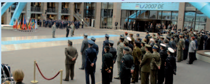
The ceremony in the newly redesigned courtyard of the EU Council Building.