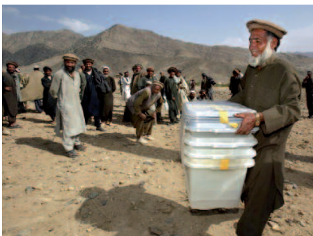
Afghan authorities face the challenges of forging national unity along with a Democracy-building process.

These objectives will be achieved through, amongst other means, monitoring, mentoring, advising and training. The mission will have a non-executive mandate. The mission will also coordinate, facilitate and provide advice on projects