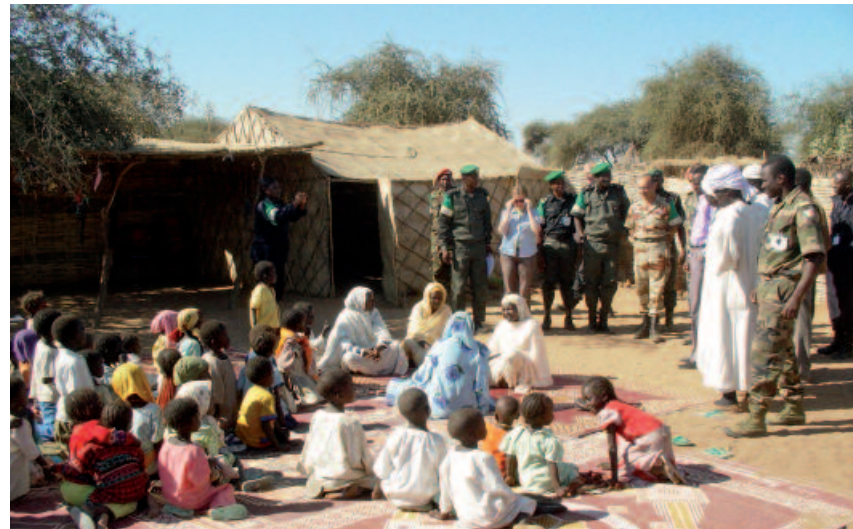
About 2.5 million people are affected by the endemic crisis in Darfur.

surviving at present on bilateral contributions from international partners including some EU Member States. The operating costs for AMIS are currently some USD 23 million per month.