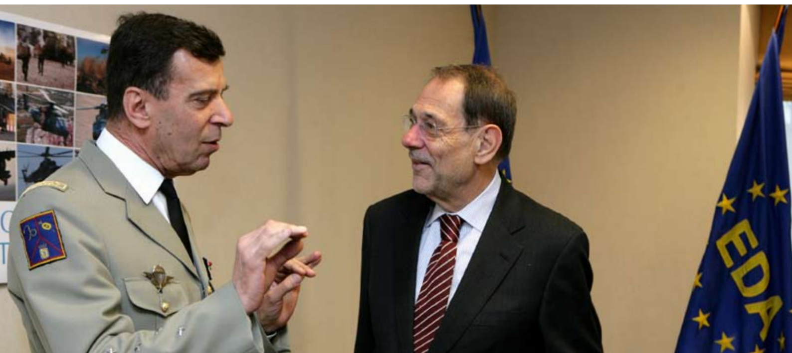
(left to right) General Henri Bentégeat & Javier Solana

Thank you for devoting your best endeavours to this matter.