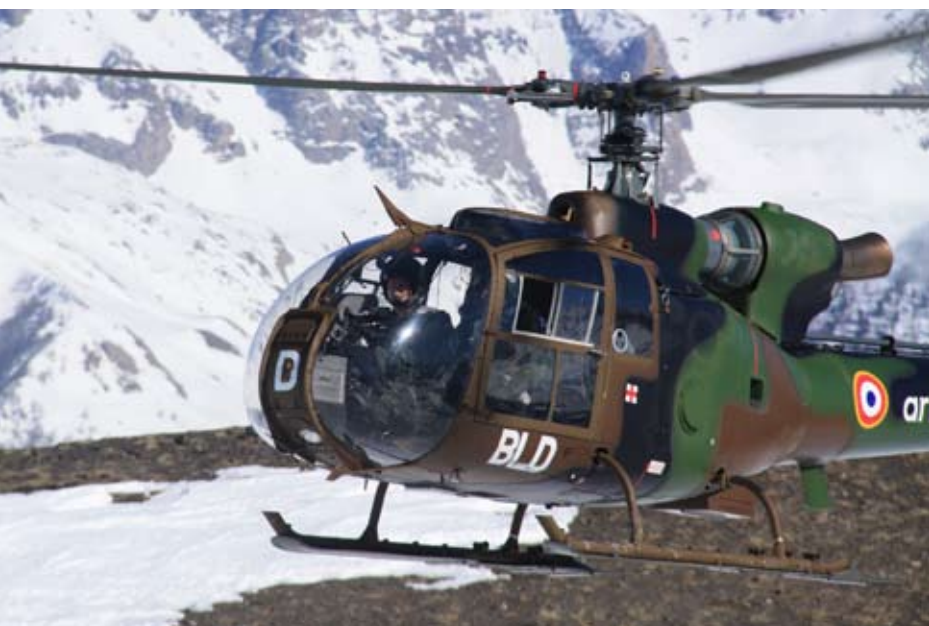
1 st Multinational HELO Mountain Exercise - March 2009

NATO official: At NATO we use the NATO Industrial Advisory Group (NIAG), in the Heavy Lift Helicopter. We have been working for more than 10 years on developing requirements, working through the various stages. We used the NIAG studies to draw industry in, and we provided them with the military requirements - and then we let industry give their advice – that's where we want to go, how can we get there, which are the industrial solutions, the cost benefits (...) Surely on the NATO side we are working with industry. I know the EDA side is also working closely with industry. For us, they are essential partners. Without industry, you can come up with great ideas, but unless industry can beat that with practical reality within the cost and technical challenge, it will not work. There is always room for improvement, but industry is there, we bring them in. I know industry always asks to be included (the earlier, the better). It's good to start the dialogue earlier.